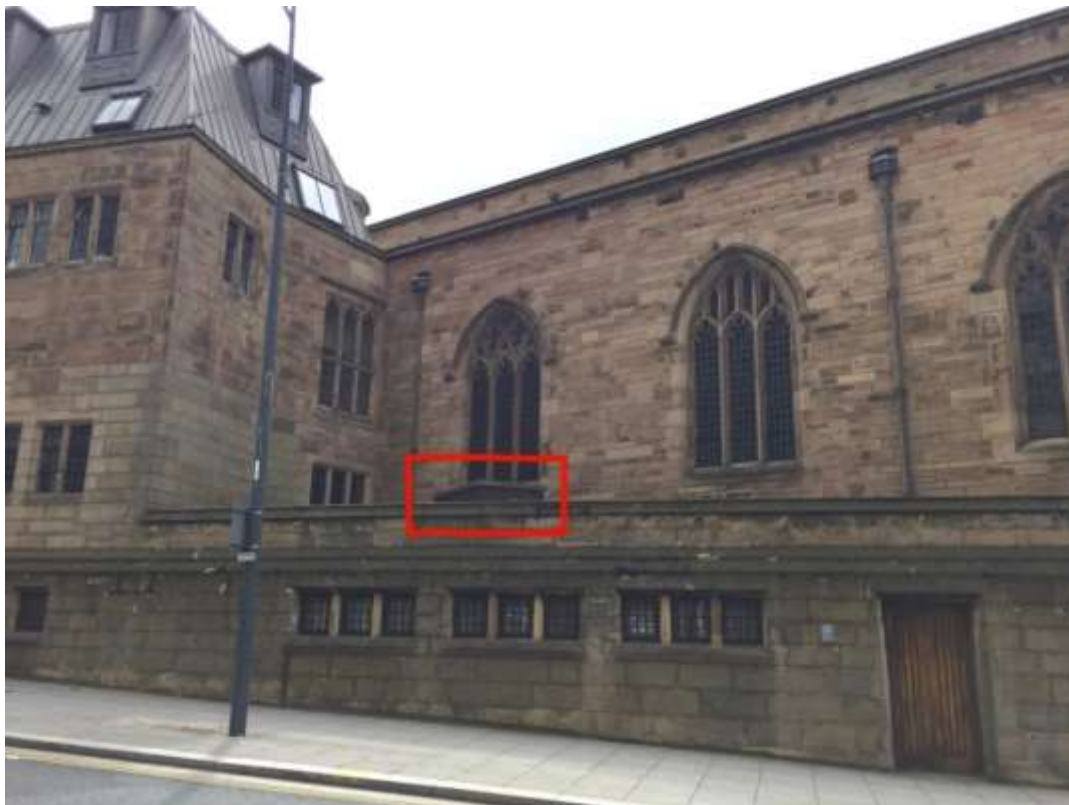
View from outside Mercure Liverpool Atlantic Tower Hotel, Chapel Street.

It is clearly visible from the busy Chapel Street, which feeds directly onto the Strand and Liverpool Waterfront.