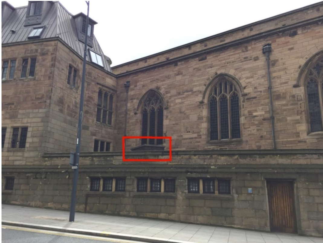
View from outside Mercure Liverpool Atlantic Tower Hotel, Chapel Street.

It is clearly visible from the busy Chapel Street, which feeds directly onto the Strand and Liverpool Waterfront.