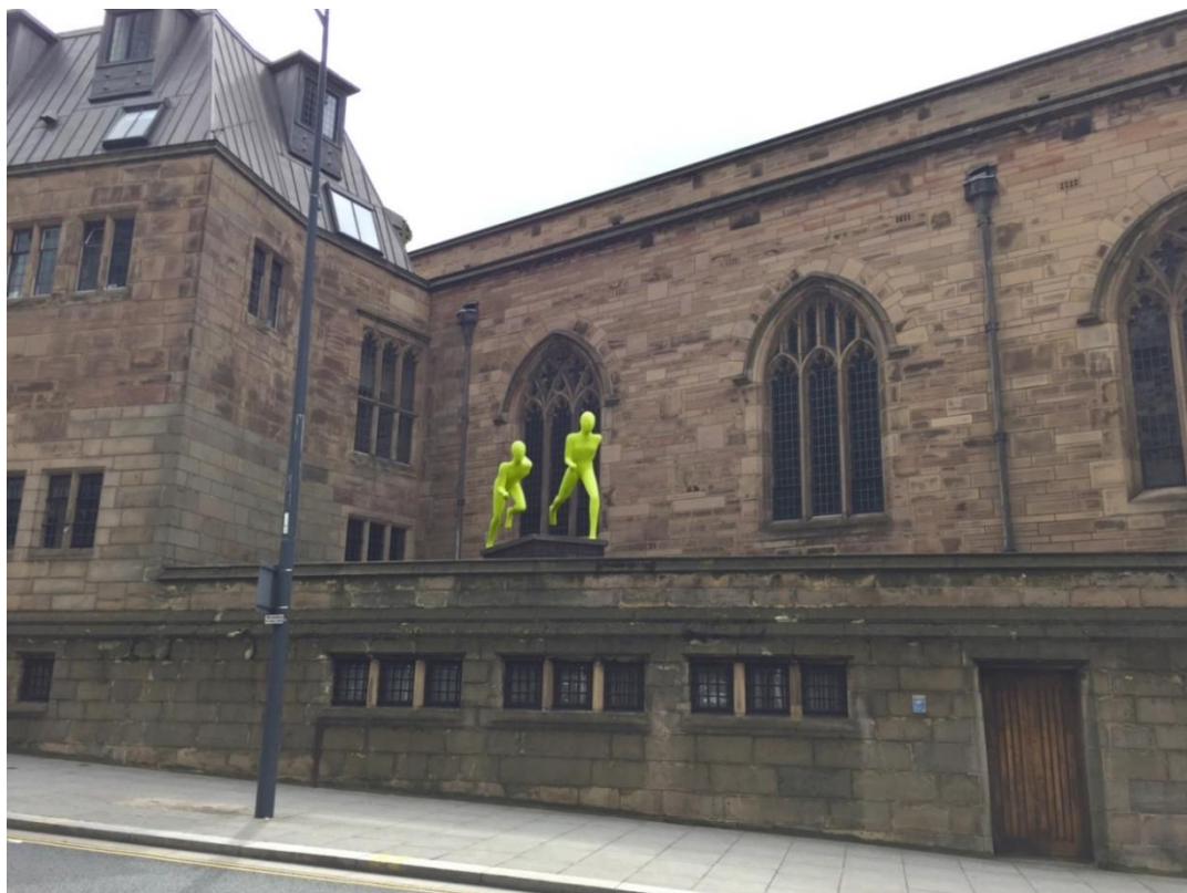
Mock up of how a new sculpture might look on the plinth